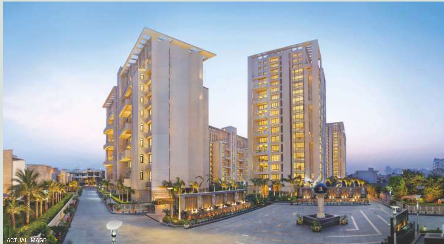
THE HIBISCUS, SECTOR-50, GURUGRAM