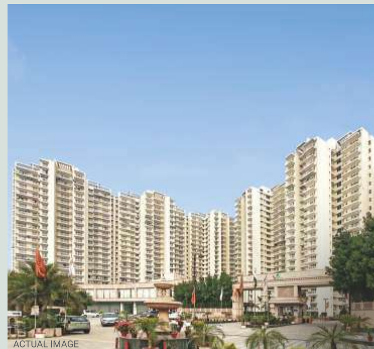
THE CORALWOOD, SECTOR-84, NEW GURUGRAM