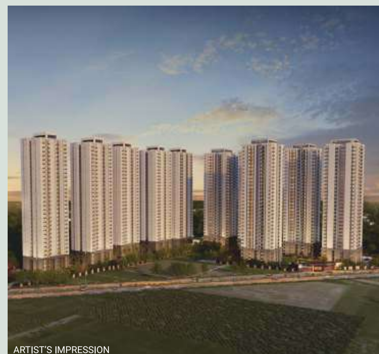
SS CENDANA, SECTOR - 83, NEW GURUGRAM