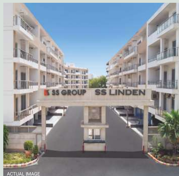
SS LINDEN, SECTOR 84 - 85, NEW GURUGRAM