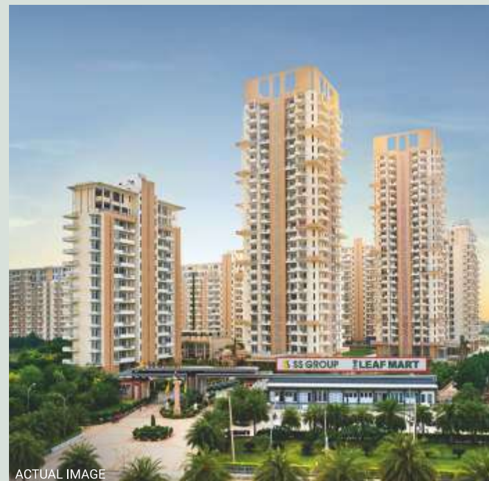
THE LEAF, SECTOR-85, NEW GURUGRAM