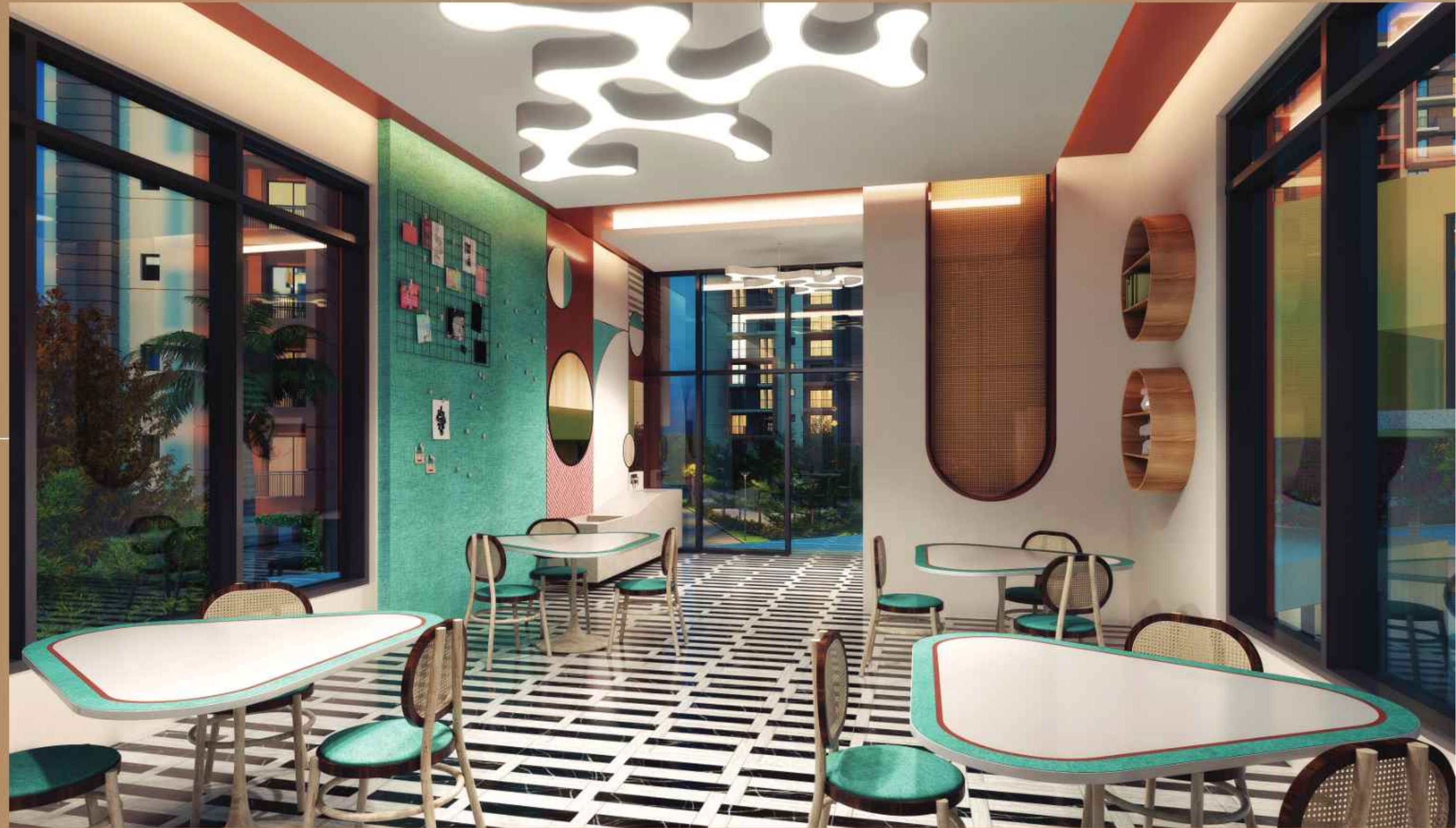
Artistic Impression of Art, Craft & Workshop Room.