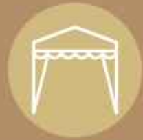
Canopy & Gazebo