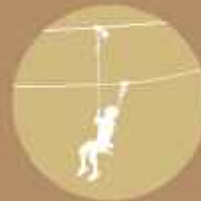
Adventure Play Area