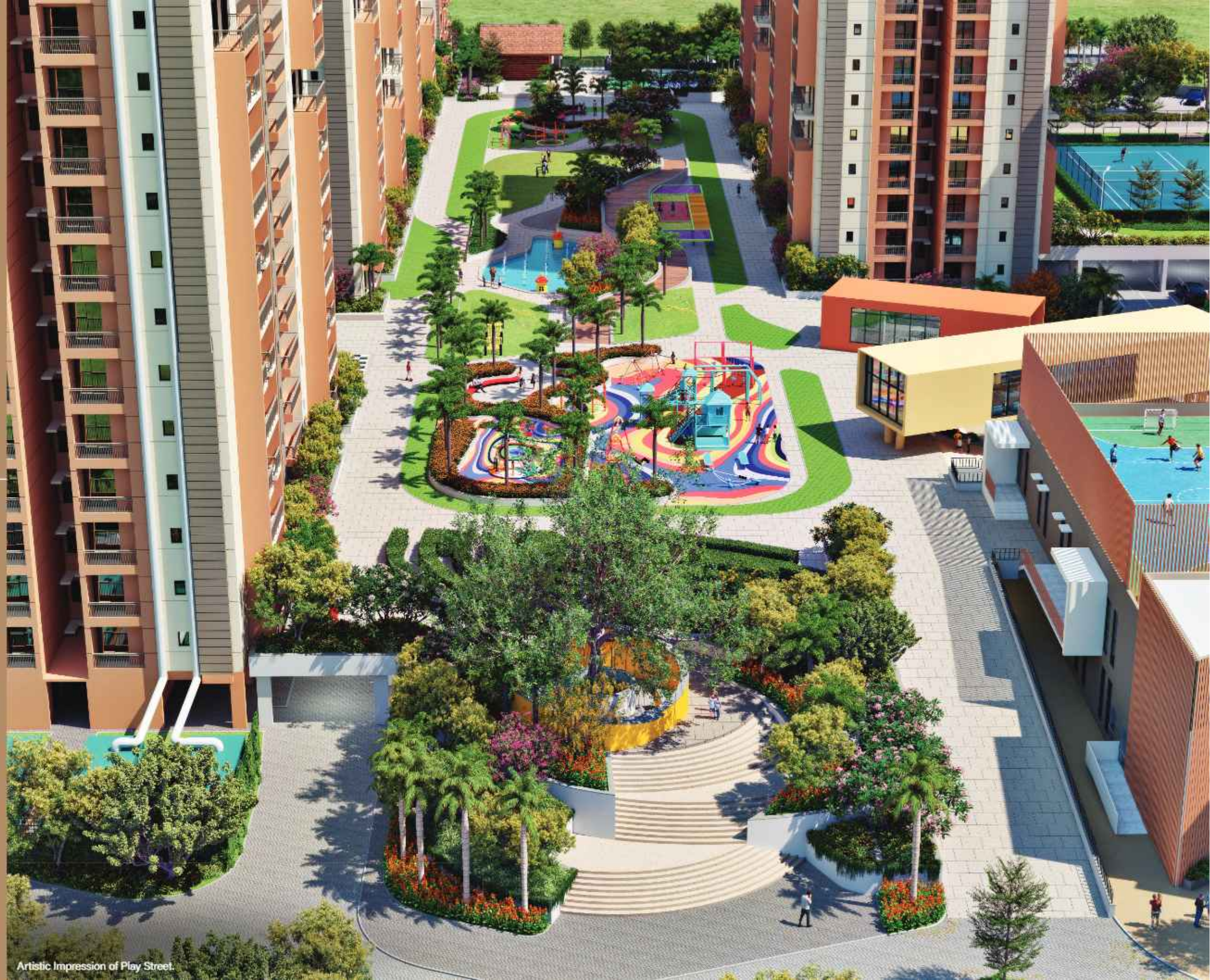
Artistic Impression of Play Street.