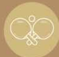
Sports Hall Billiards & TT