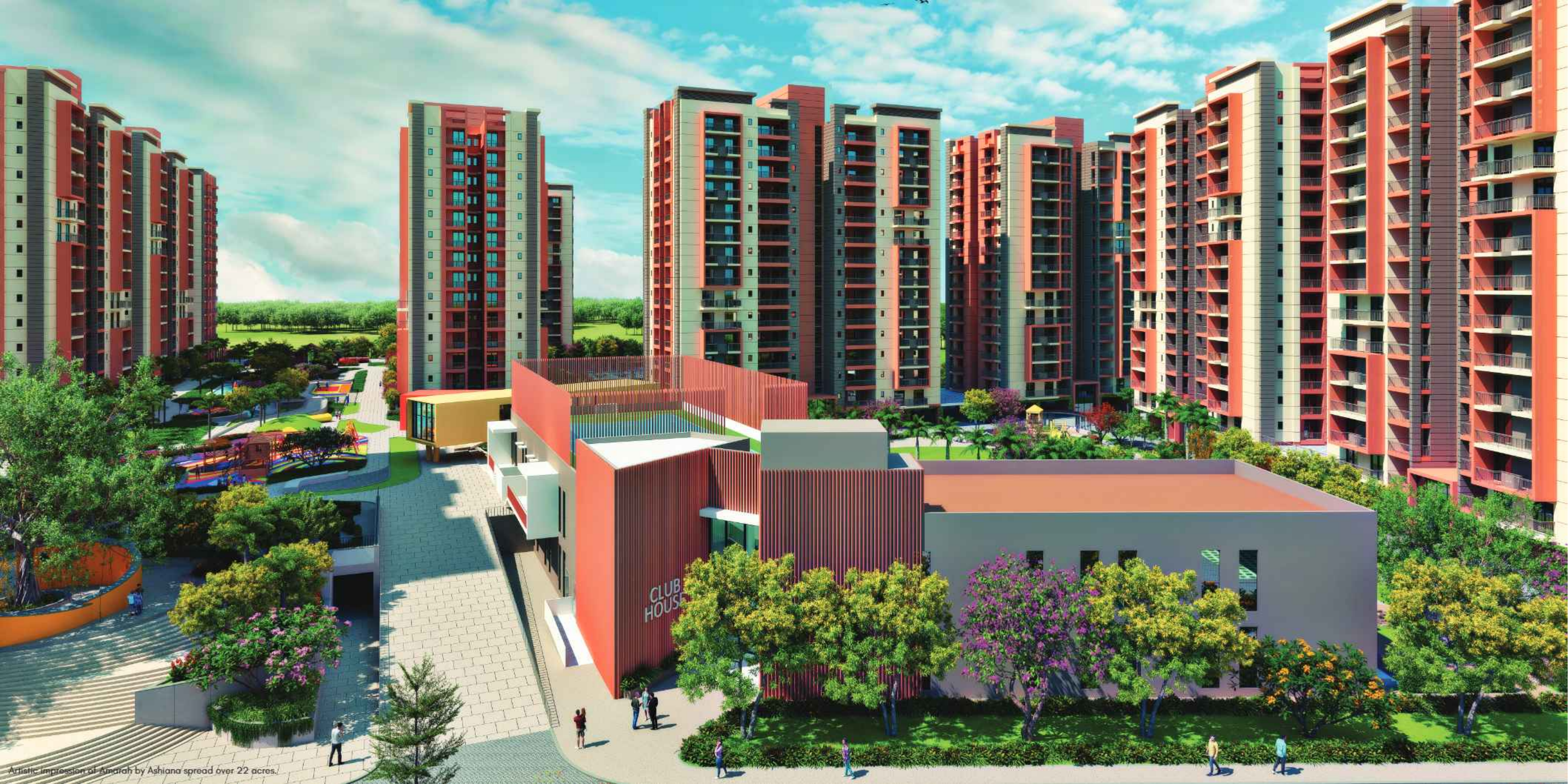
Artistic impression of Amarah by Ashiana spread over 22 acres.