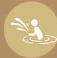
Water Play Area