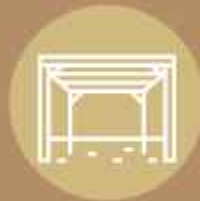
Seating with Pergola