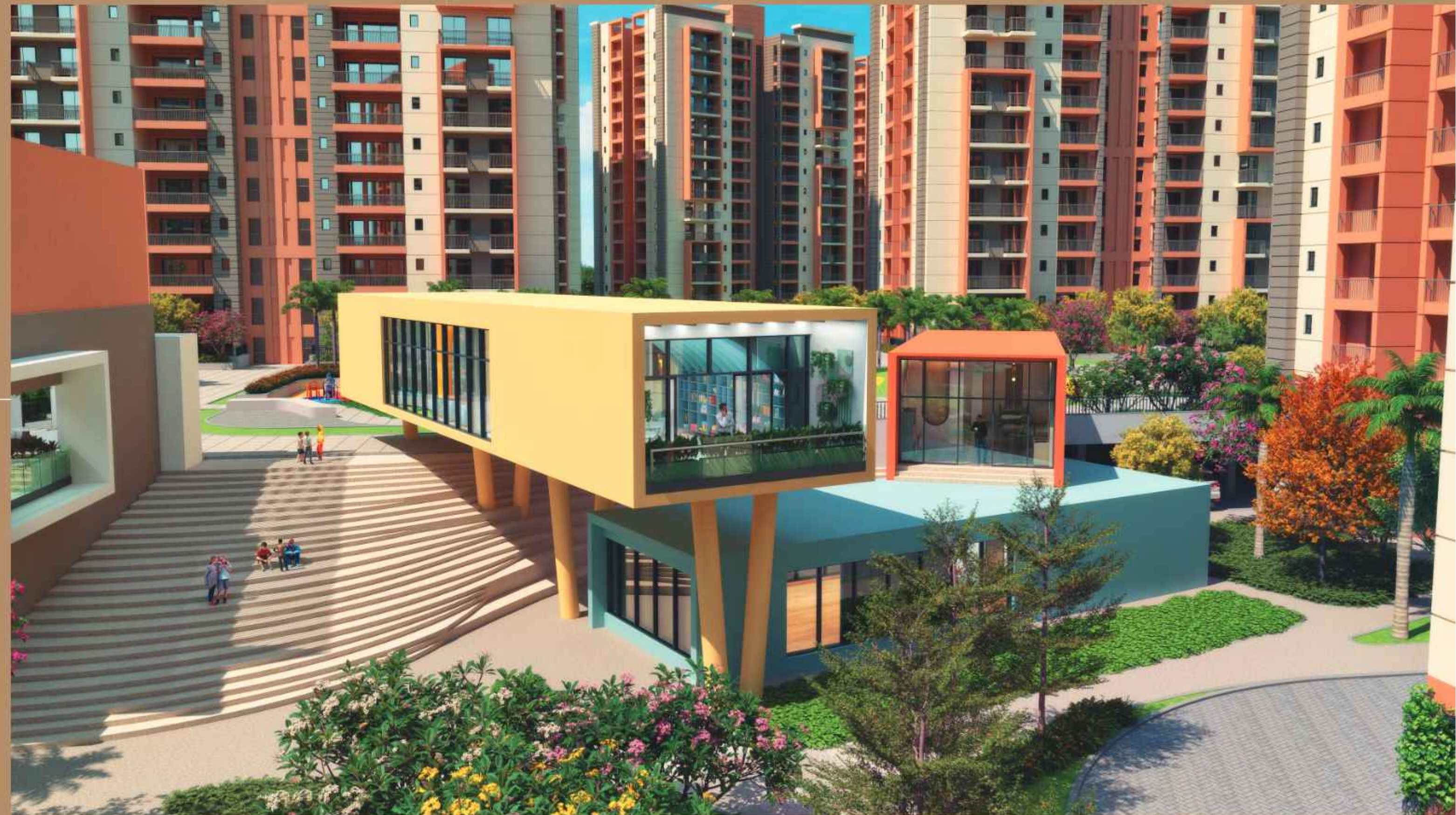
Artistic Impression of Learning Hub.