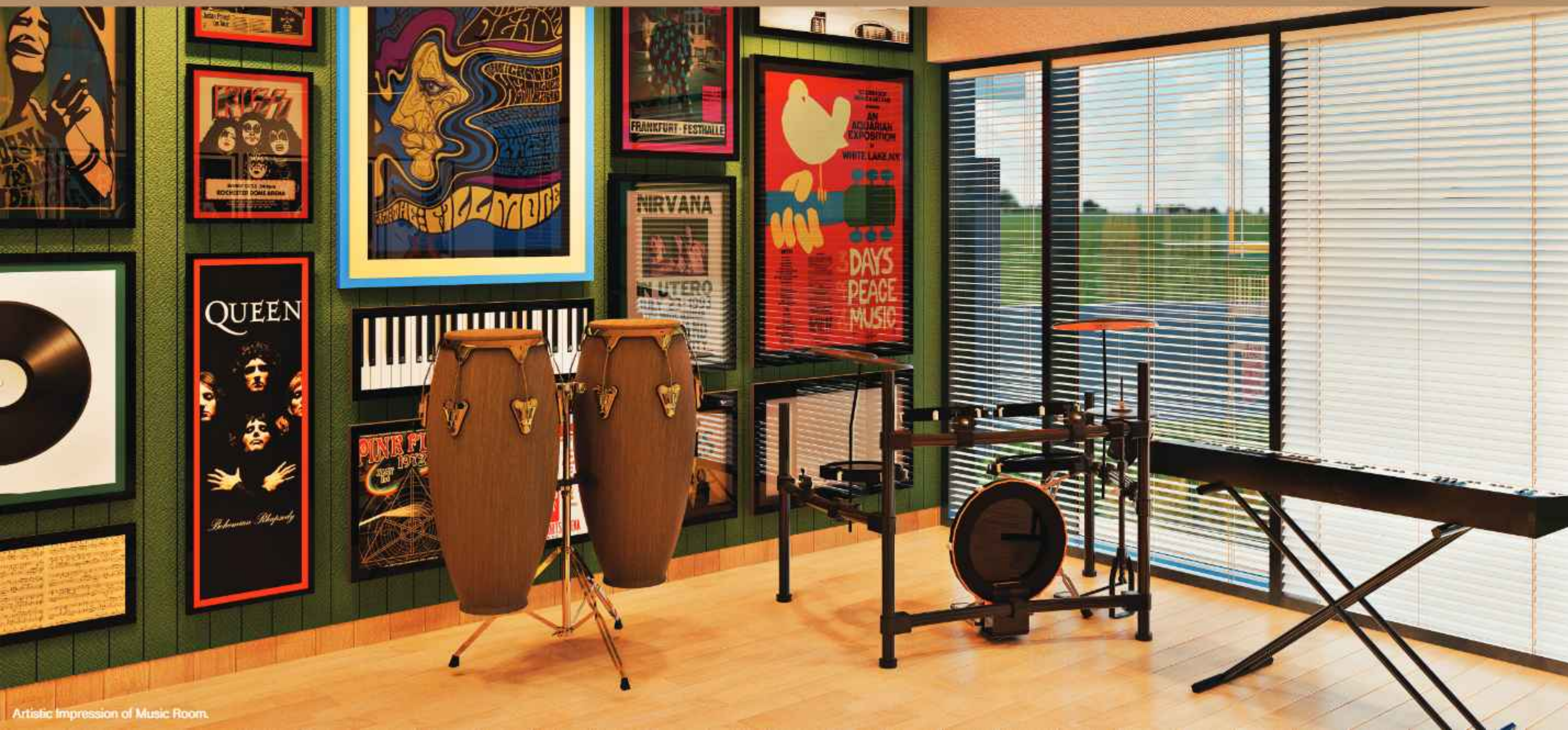
Artistic Impression of Music Room.