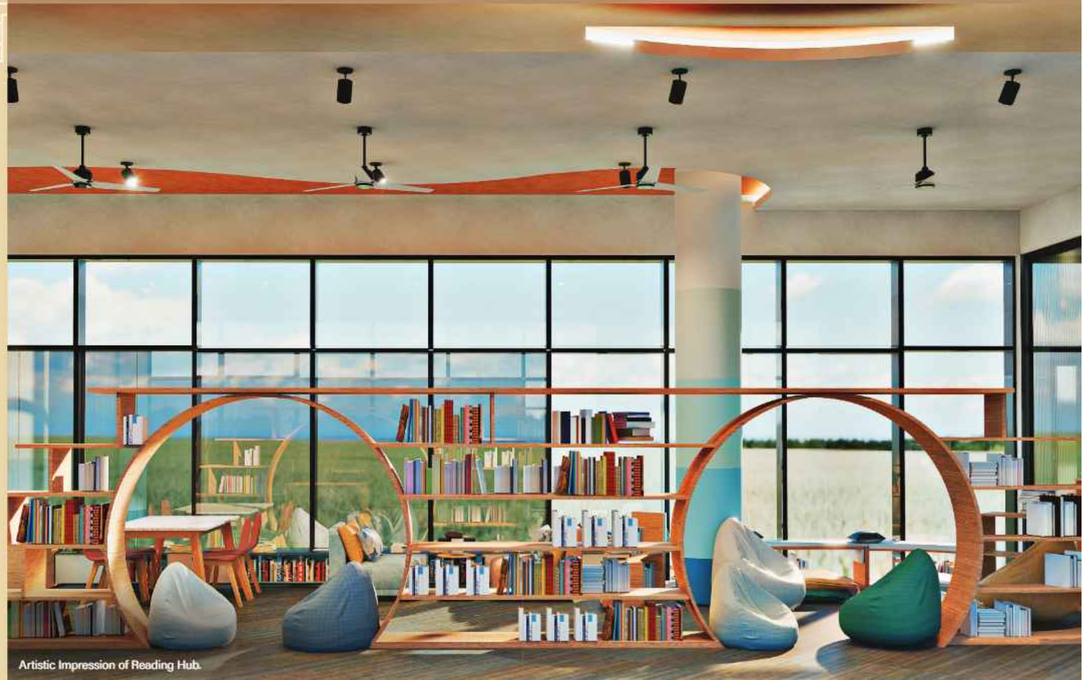
Artistic Impression of Reading Hub.