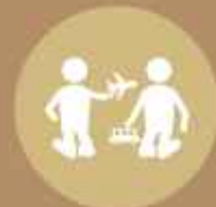
Kids Play Room